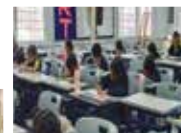
MINI ARTISTS CLUB