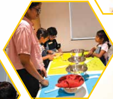
Little Chefs on Job