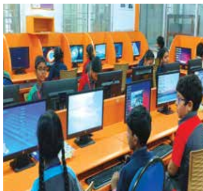
TINY TECH EXPLORERS CLUB

Overall, the Club Activities and the Inter-House Sports Competition fostered healthy competition, teamwork, and strong camaraderie among students. The event proved to be an enriching experience, leaving participants motivated, inspired, and eager to further nurture their talents.