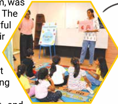
Healthy Food Habits

concluded with a sense of accomplishment and enthusiasm, as children proudly displayed their fruit bowls