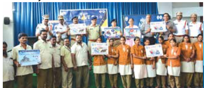
Road Safety Awareness Session for School Transport Staff

The event concluded with appreciation for the efforts of the traffic police and school authorities in promoting road safety and building a strong culture of responsible driving in the city.