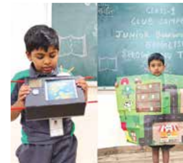
JUNIOUR BOOKWORM CLUB

Cultural awareness was promoted through Show and Tell sessions, where students confidently presented elements of India's rich heritage and traditions. Elocution helped to develop leadership qualities, self-confidence and effective communication skills. Interactive computer-based games focusing on typing and basic math