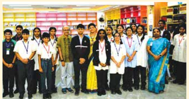
Students Cherishing Moments with the Author