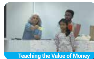
Teaching the Value of Money