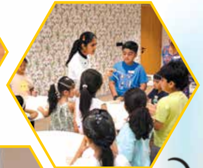
Learning the Culinary Skills