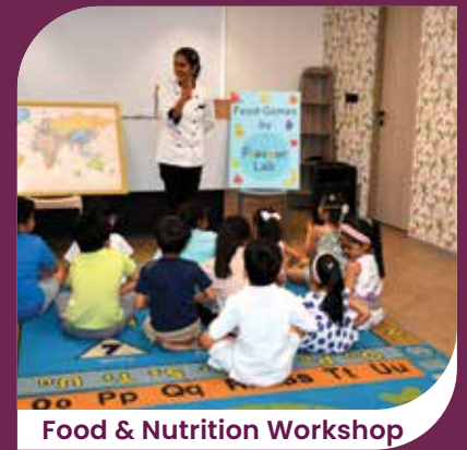
Food & Nutrition Workshop