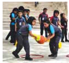
INTER HOUSE COMPETITION