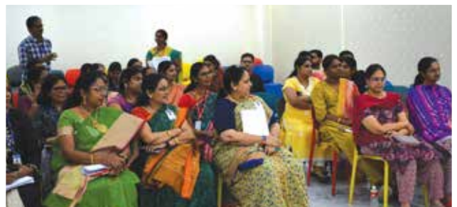
Parent teacher Association Meeting