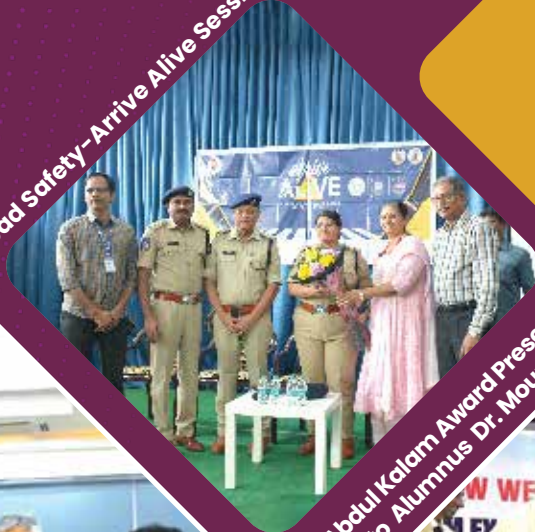
Road Safety-Arrive Alive Session