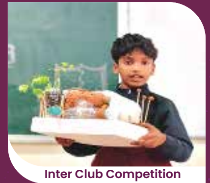
Inter Club Competition