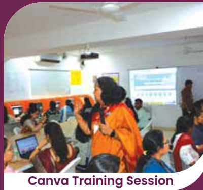
Canva Training Session