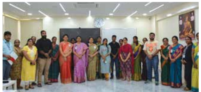
Parent teacher Association Members

The Director informed parents about infrastructure upgrades, academic collaborations, technology integration, and various student programmes. The meeting concluded with an interactive question answer session, reinforcing cooperation between parents and the school in supporting student excellence and holistic development, including discipline, moral values and etiquette in using technology.