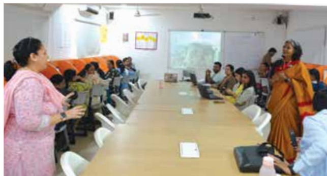
Teachers Active Participation

The session was highly interactive and informative and provided valuable exposure to digital tools that can transform the teaching-learning process. Teachers actively participated and clarified their queries.