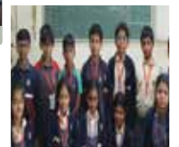
LITTLE LEADERS CLUB