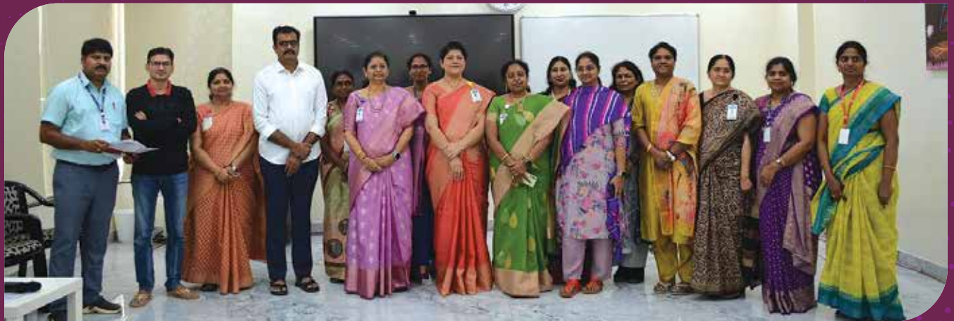
Parent Teacher Association Meeting