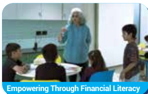
Empowering Through Financial Literacy

workshop aimed to build early awareness about financial habits through interactive and playful learning techniques. This workshop for kids proved to be an innovative step towards nurturing financial understanding among young learners.