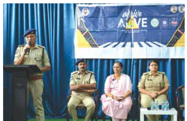
Promoting Safe Driving Practices in “Arrive Alive” Programme

The programme was attended by around 200