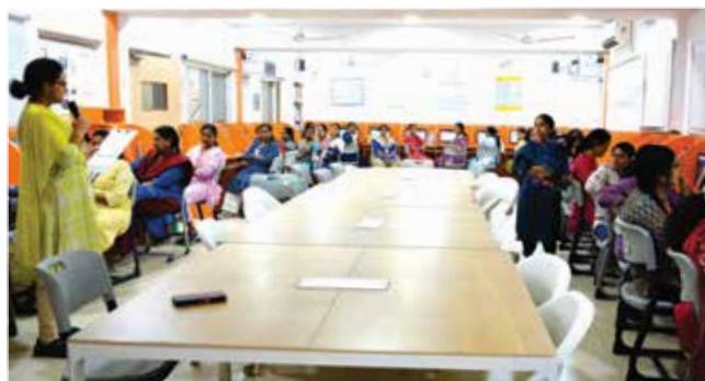
Learning Digital Design to Enhance Creativity