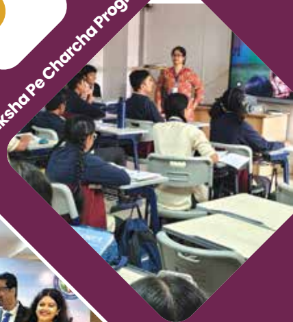
Pariksha Pe Charcha Programme