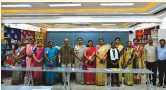
Staff Interaction with the Author

The programme concluded with a vote of thanks, expressing appreciation to the author, the school management, teachers, and students for making the event a memorable and enriching experience.