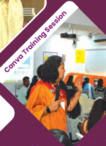
Canva Training Session