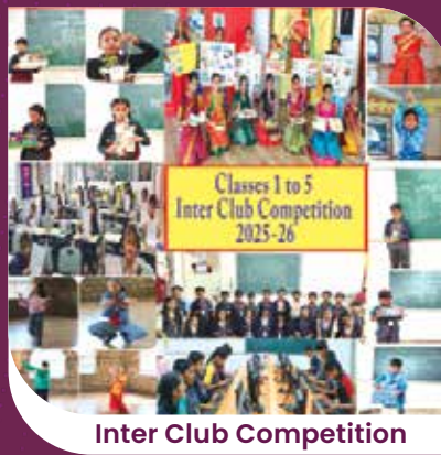
Inter Club Competition