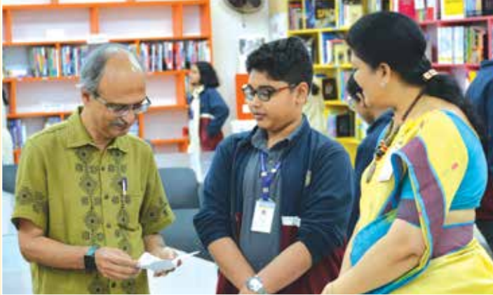
Encouraging Young Talent