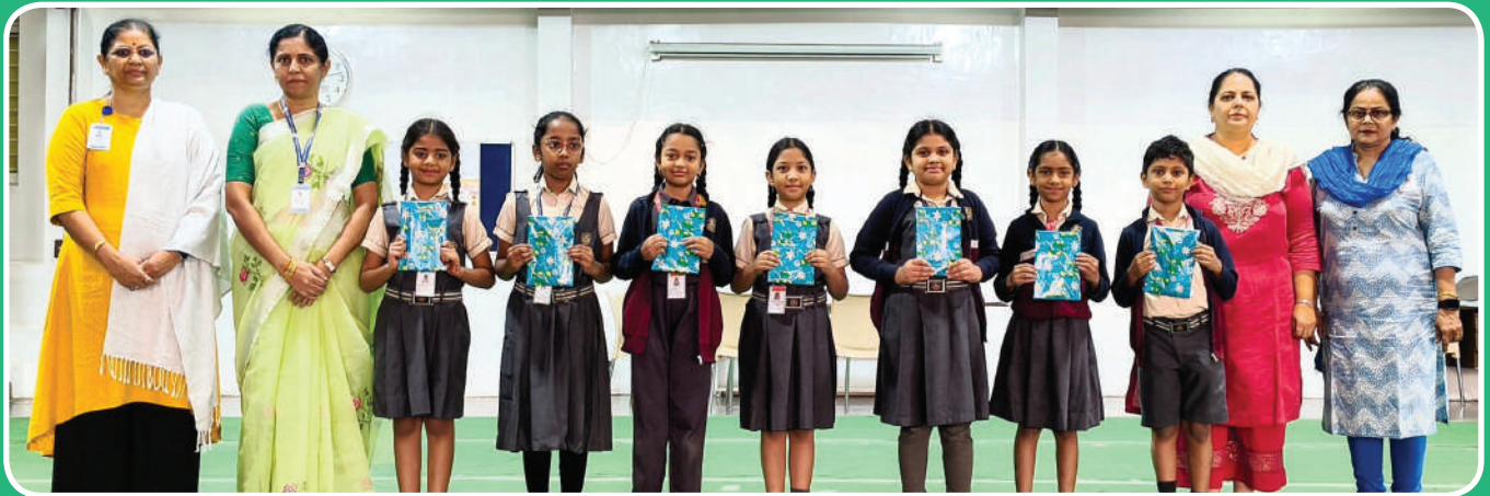
Winners of National Library Week Competitions

characters and bringing them to life through dramatic performances. The event provided a platform for students to showcase their public speaking skills and literary talents, explore characters' personality, traits and motivations. They developed their creative writing skills and connected with characters on a deeper level by writing diary entries from the perspective of their favourite book characters. They also participated in a 'Book Promotion Contest', wherein students spoke about the book and the authors alluring the readers. The activities were thought-provoking and encouraged students to think creatively. Prizes were distributed to the winners. The event reinforced the importance of libraries and reading in students' lives, inspiring them to develop a lifelong love for books and learning.