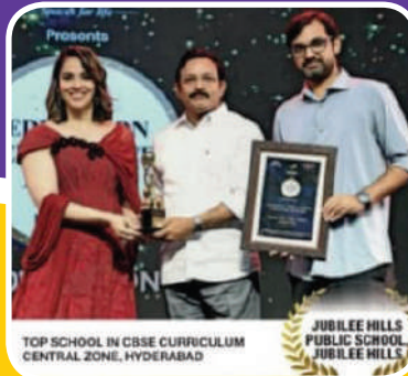
TOP SCHOOL IN CBSE CURRICULUM CENTRAL ZONE, HYDERABAD

JUBILEE HILLS PUBLIC SCHOOL JUBILEE HILLS