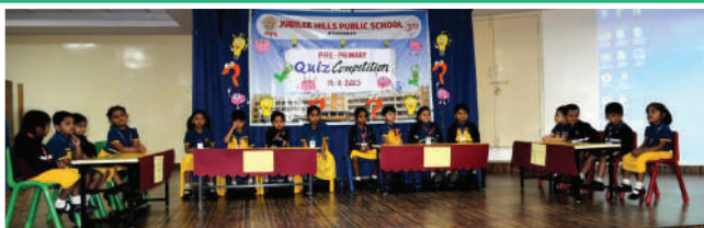
Pre Primary Quiz Competition