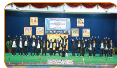
Finale - Aila Re Aila