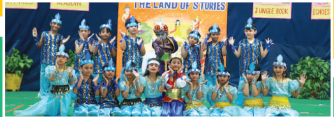
Classes UKG & LKG (A,B & C) Pratibha Darshan