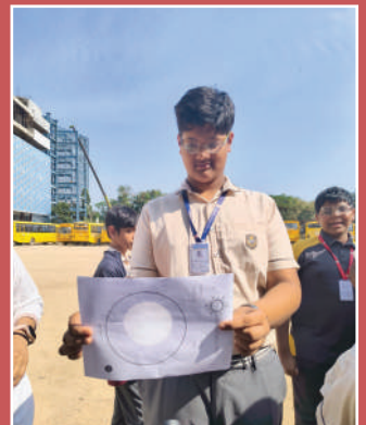
Solar Observation Activity