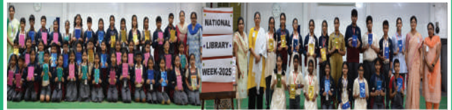
National Library Week Celebrations 2025