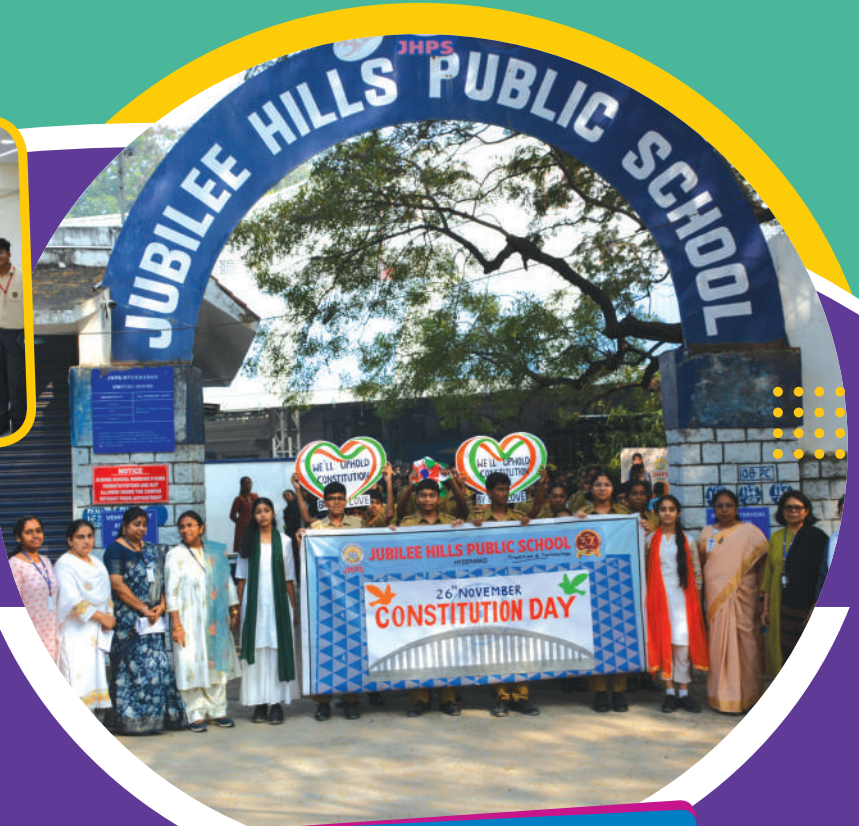
Constitution Day 2025