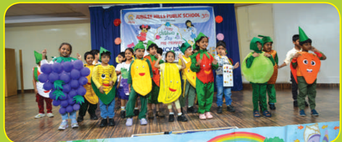
Tiny Stars in Colourful Costumes