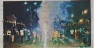
People burn firecrackers to celebrate the occasion.