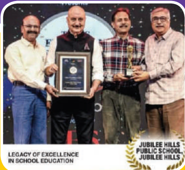
LEGACY OF EXCELLENCE IN SCHOOL EDUCATION

JUBILEE HILLS PUBLIC SCHOOL JUBILEE HILLS