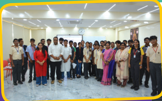
Inter School Awareness Competition Organised By Hyderabad City Security Council (HCSC)