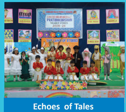
Echoes of Tales