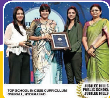
TOP SCHOOL IN CBSE CURRICULUM OVERALL, HYDERABAD

JUBILEE HILLS PUBLIC SCHOOL JUBILEE HILLS