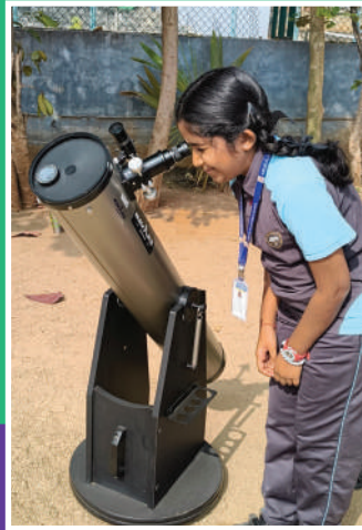
Solar Observation Activity