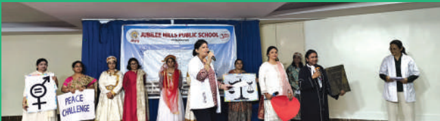
Children's Day Celebration