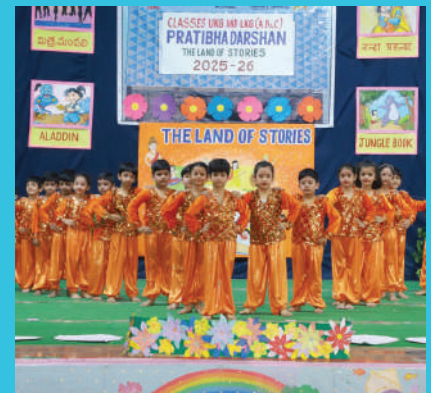
My Friend Ganesha