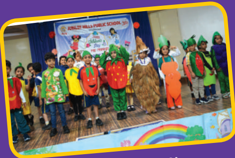
Fancy Dress Show