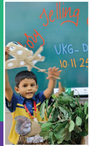
Story Telling Competition