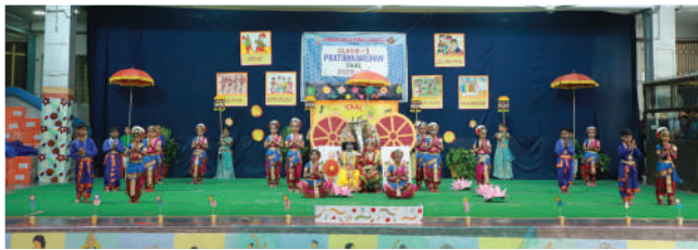
Class-1 Pratibha Darshan