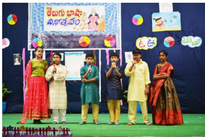
Song – Telugu Bhasha Goppatanam