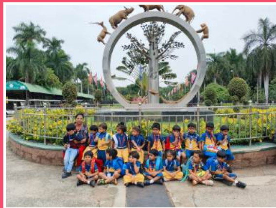
Nehru Zoological Park