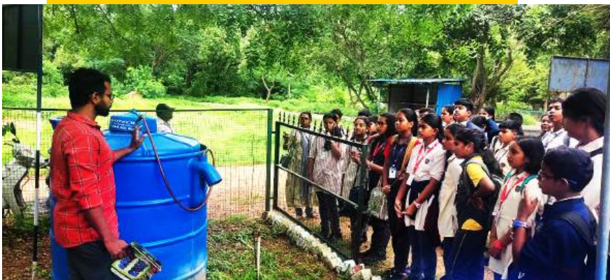
Field Trip - NIRD (National Institute of Rural Development)