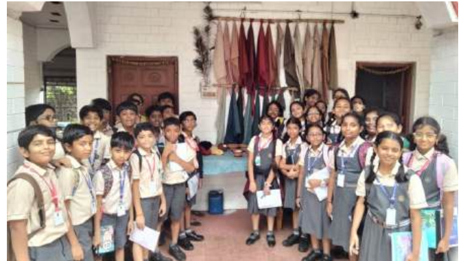
Field Trip - NIRD (National Institute of Rural Development)