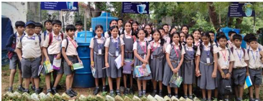
Portable Bio Gas Plant