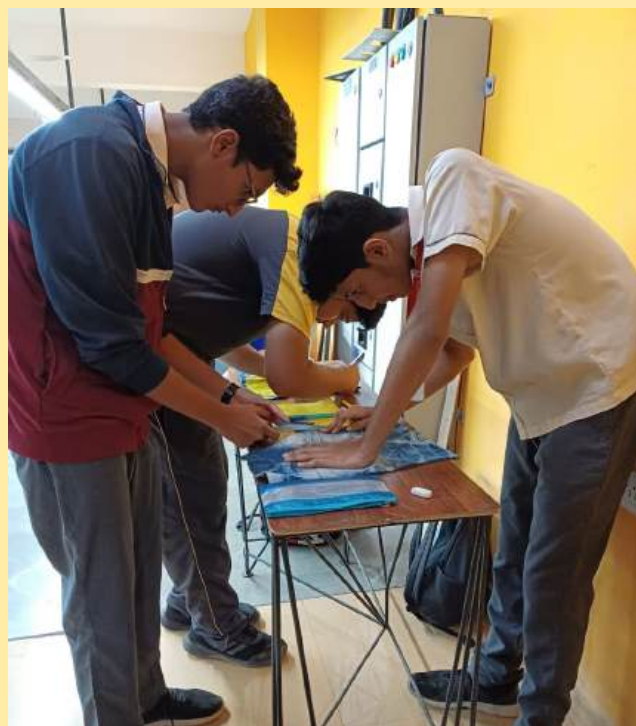
Sewing a Cloth Bag