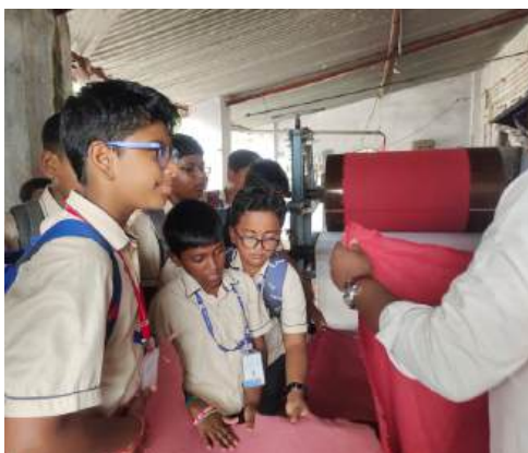
Processing of Handmade Paper