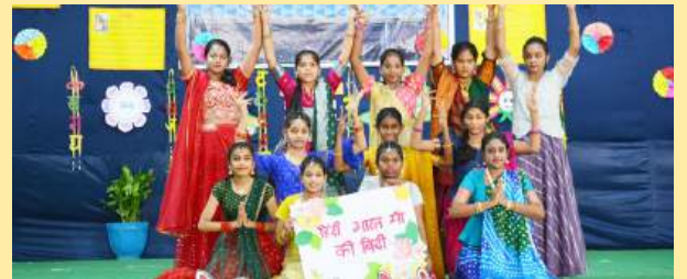
नृत्य - हिंदी, भारत के माथे की बिंदी