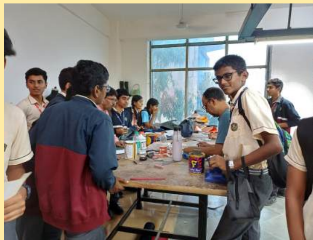
Hands on Experience in Designing