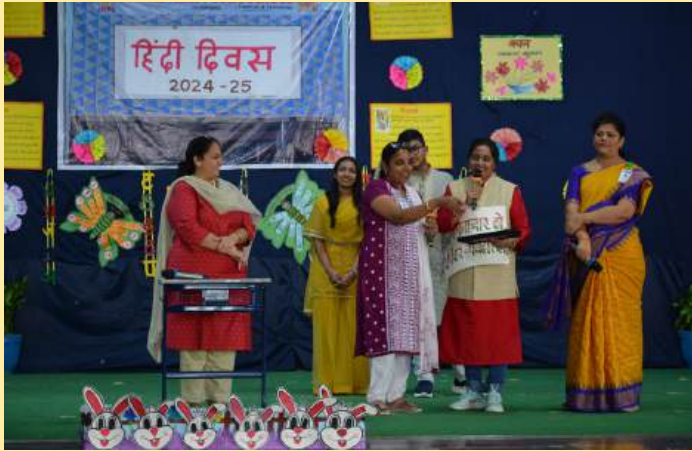
शब्दों का खेल - पर्यायवाची शब्द