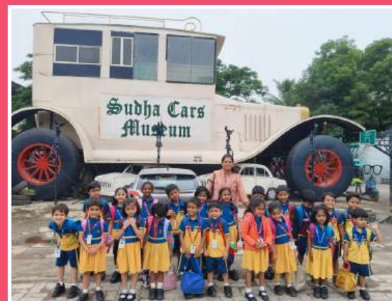
Sudha Car Museum