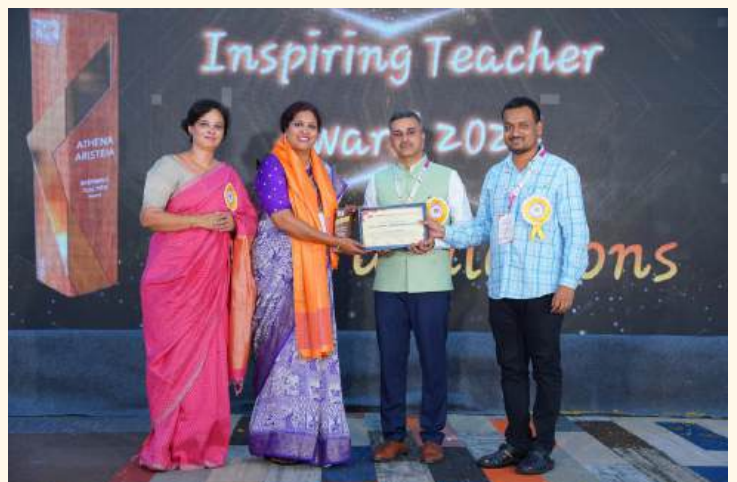
Hall of Fame