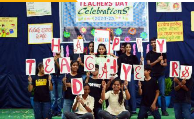
Teachers Day Celebrations