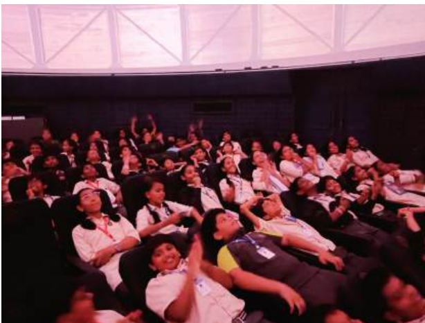
Galaxy Show at The Planetarium