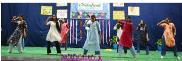
Students Expressing Their Gratitude