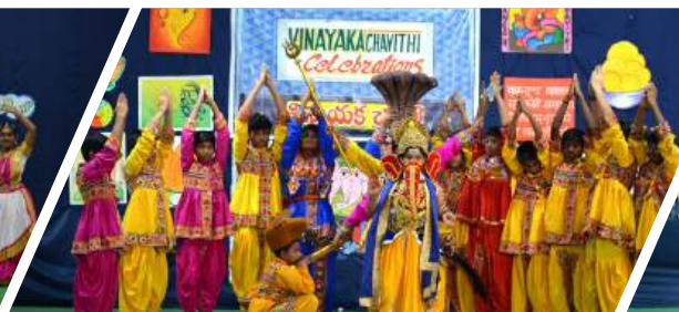
Ganesh Chaturthi Celebrations