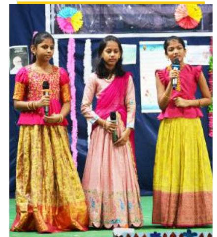
Telugu Bhasha Dinotsavam