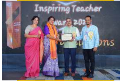
Most Inspiring Teacher 2024