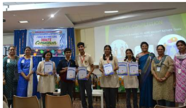
The Proud Winners