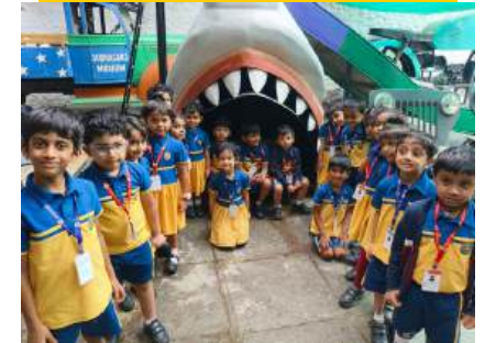
Field Trip - Sudha Car Museum