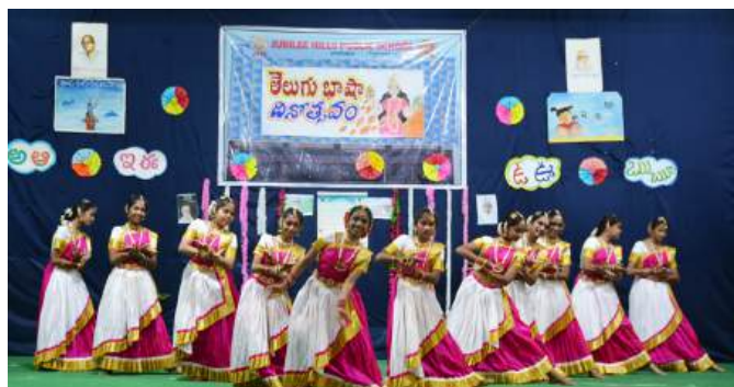
Dance – Tene Kanna Teeyanaina