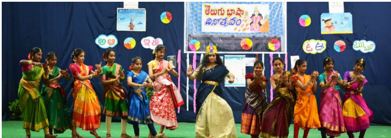
Skit – Telugu Talli Aavedana