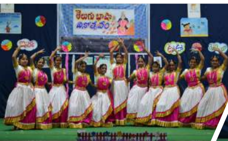
Telugu Bhasha Dinotsavam