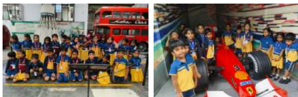
Children's Exploring Different Types of Cars

Students love the magical experience of seeing cars that look like toys come to life. The cars shaped like cupcakes, pencils, shoes, Ram Mandir, computer, hand bag, swan, house and many more. Children are likely to be mesmerized by the creativity on display. The museum is colourful and full of photo opportunities, perfect for capturing memories. A visit to The Sudha Car Museum is not just about looking at cars it's about inspiring students to think creativity and explore the possibilities of design and innovation. It also encourages imaginative thinking and connects classroom learning with real-world application.