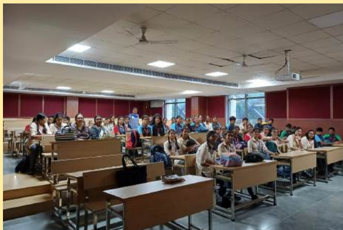
Lecture on Future Prospects in Designing