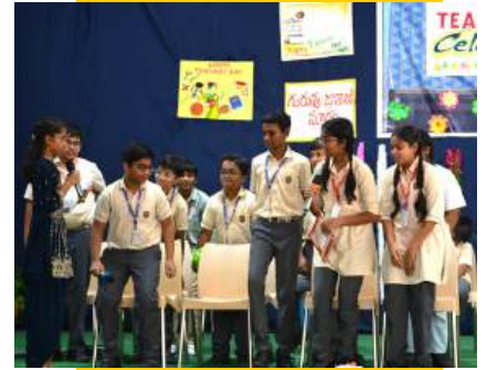
Teachers' Day Celebrations