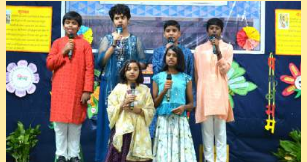
गाना - हिंदी है हम वतन है हिंदोस्तां