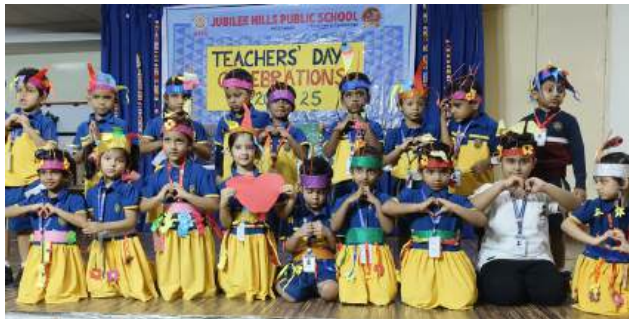
Tiny Tots Expressing their love for Teachers

The day's festivities began with a special assembly in the school auditorium. Students from various grades presented a series of performances that included songs, dances and skits. These performances, carefully curated by the Student Council, were a lively and colourful expression of their love and admiration towards the teachers.