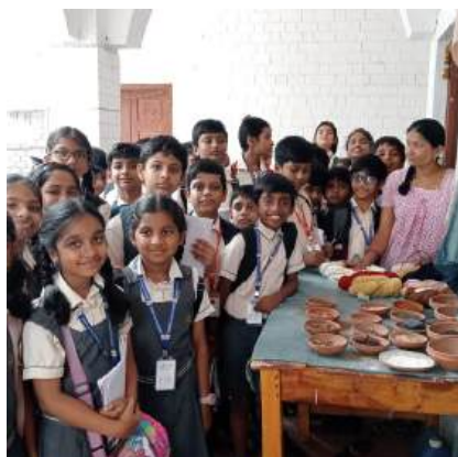
Textile, Yarn, Dying Process