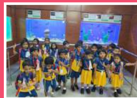
Adventure at the Zoo