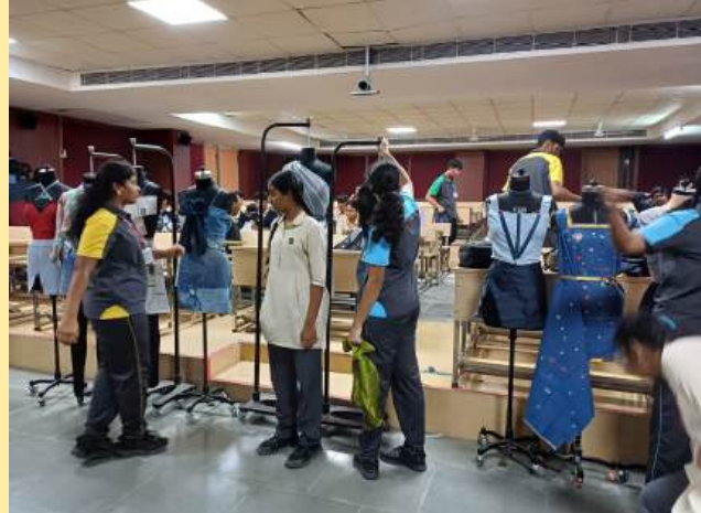
Students Engaged in Drafting

The Educational trip was indeed a learning experience for the students of class 10.