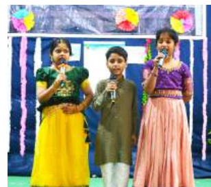
Poems & Poetry