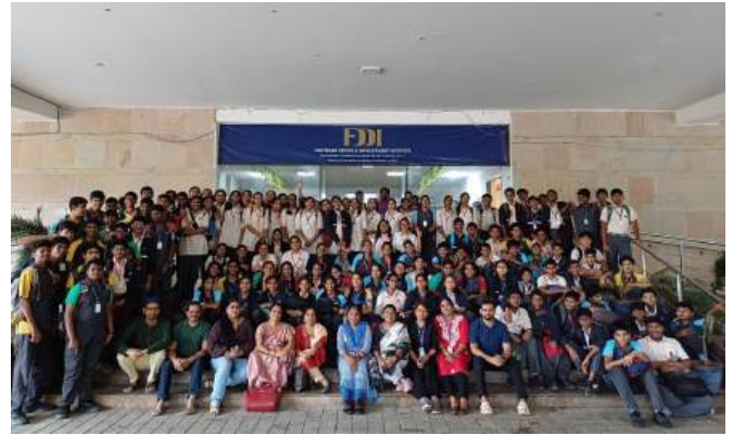
Field Trip - Footwear Design and Development Institute (FDDI)