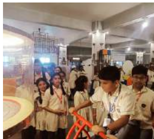
Exploring The Science Museum