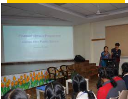
Financial Literacy Workshop