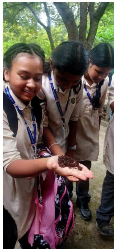
Hands on learning Vermicomposting