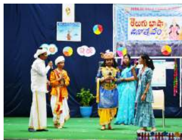
Drama – Telugu Bhaasha Vaibhavan

Students adorned in colourful traditional attire enthralled the audience with songs, dances and skit that captured the essence of Telugu culture. The programme also reminded the students that languages are the true reflection of a community's identity and history.