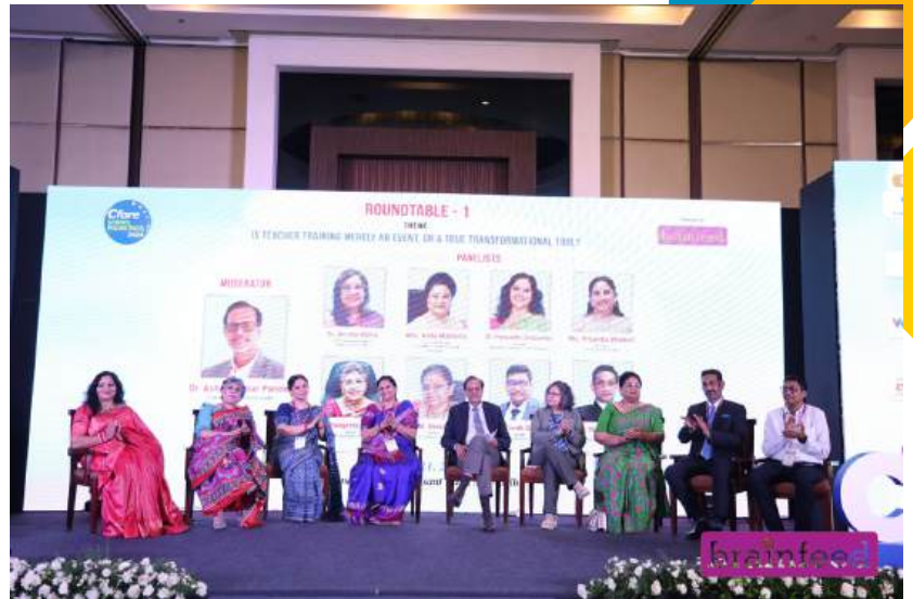
Panelists Discussing About Teacher Training – A True Transformational Tool