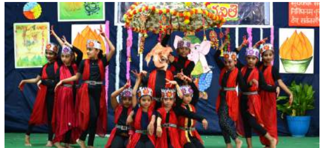
Dance-Anandha Ganapathi Nadanam

The celebrations were a resounding success which not only enriched students' understanding of traditional practices but also fostered a sense of community and shared celebration.