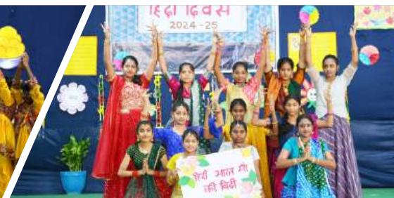
Hindi Diwas Celebrations