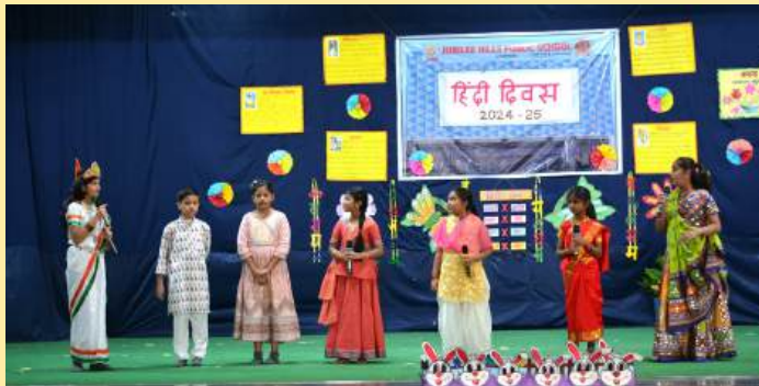
हिंदी पर नाटक