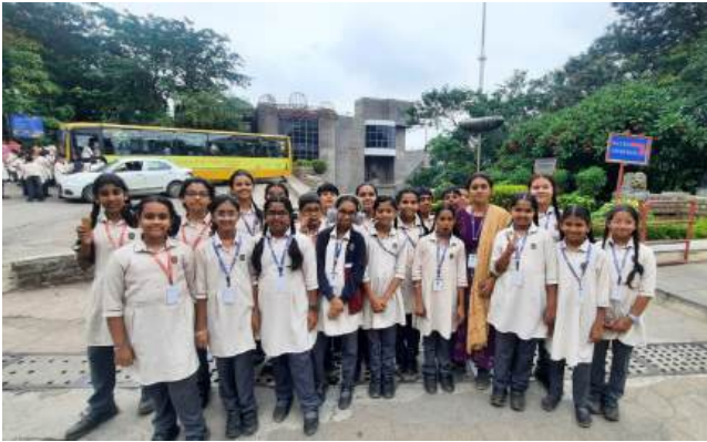
A visit to Birla Science Museum and Planetarium

The combination of interactive exhibits, informative displays, and the planetarium show provided an immersive experiential learning environment which helped the inquisitive minds to enhance their knowledge on the concepts that always wondered