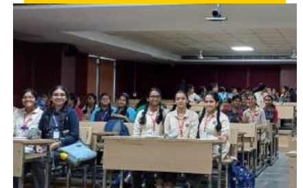
Field Trip - Footwear Design and Development Institute (FDDI)