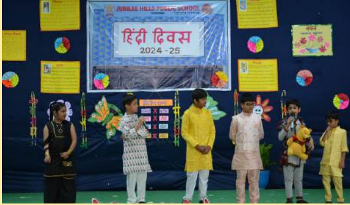
कविता - हिंदी भाषा पर विविध कविताएँ