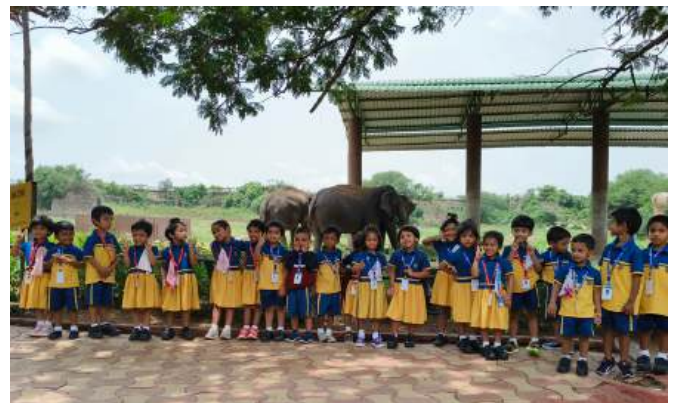
Field Trip - Nehru Zoological Park