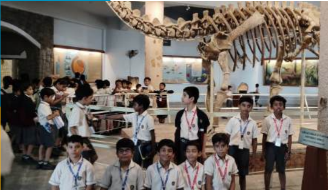
Field Trip - Birla Planetarium and Science Museum