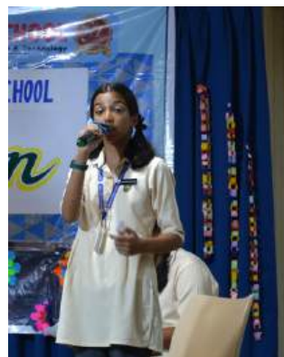
Technology – Pros & Cons – The Big Fight