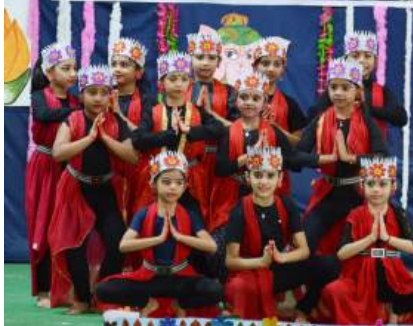
Ganesh Chaturthi Celebrations