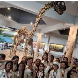
An Extinct Kotasaurus