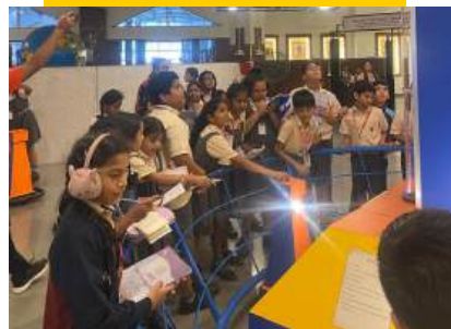
Field Trip - Birla Planetarium and Science Museum